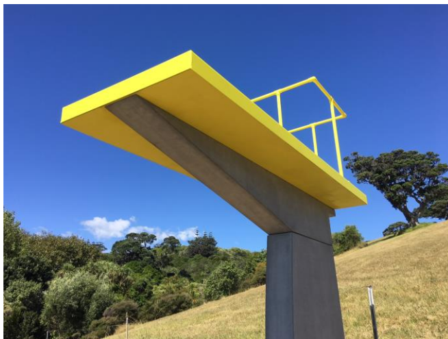
Natalie Guy The Pool 2018–19.

Please refer to high resolution image folder here.